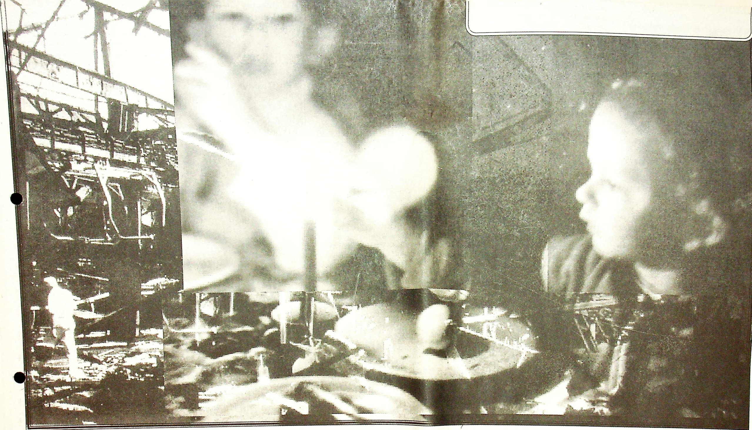
Kinder aus Kragujevac Ostern 1999, bei Kerzenlicht während der Bombardierung Im Hintergrund das zerstörte Automobilwerk Zastava, Fotomontage

Die Europäische Tribunalveranstaltung in der Bundesrepublik Deutschland beginnt am 30. Oktober 1999 in der Heilig-Kreuz-Kirche in Berlin Kreuzberg 10 Uhr bis 18 Uhr. Im Mai 2000 wird die Anklage vor internationalen Richtern verhandelt.