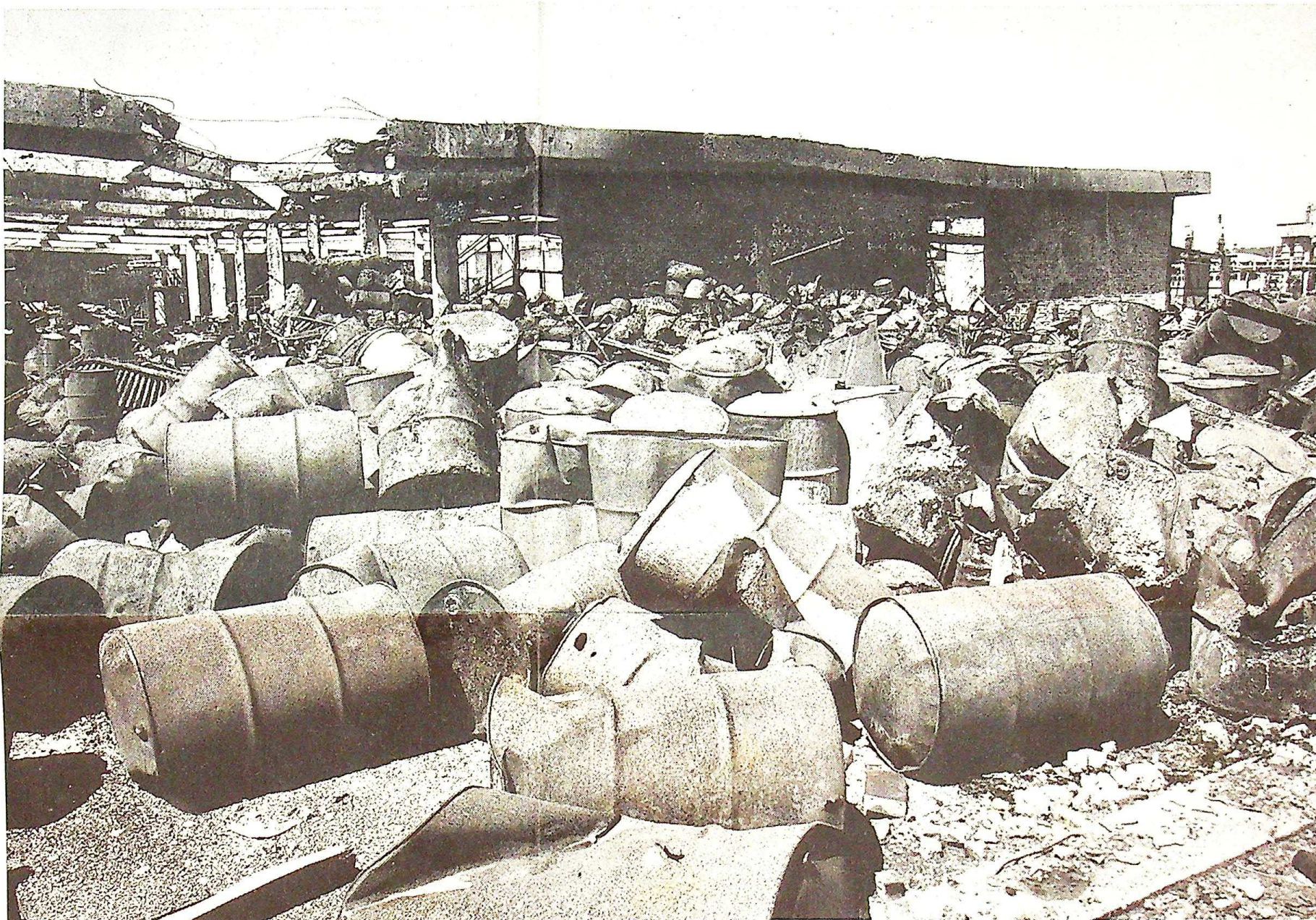
Bombardementschade op het terrein van de olieraffinaderij van Novi Sad.

Bij de bombardementen werden 74.000 ton olie en oliederivaten vernietigd, negentig procent verbrande, de rest kwam in de grond en in de rivier terecht. Dagenlang hing een verstikkende en met zwaveldioxyde vergiftigde rook boven de oude barokstad aan de Donau, met zijn 280.000 inwoners. Het grondwater raakte ernstig vervuild, en dat terwijl de belangrijkste drinkwaterbronnen zich op twee kilometer van de raffinaderij bevinden: zestig procent van het drinkwater van Novi Sad wordt daar opgepompt, uit bronnen op 25 meter diepte. We moeten een dam bouwen tussen de raffinaderij en die drinkwaterbronnen, zegt Dopudja, want de vervuiling van het grondwater ruikt op richting bronnen. Een bijkomend probleem is dat het ondergrondse systeem voor het vervoer van het afvalwater van de raffinaderij is vernield. Op dit moment vloeit dat afvalwater ongezuiverd in de Donau. „We weten zelfs niet waar de pijpleidingen gebroken zijn”, zegt Dopudja.