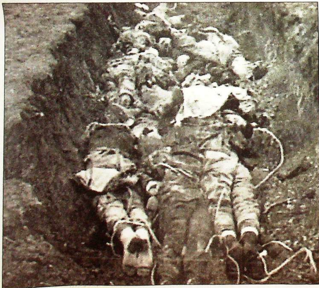
Een stuk of twintig dode mannen liggen in een kuil, ergens ten westen van de Tsjetsjeense hoofdstad Grozni. Rechts trekt een vrachtwagen een lichaam aan een touw.

Voor de Europese Unie is dat zeker niet genoeg. Coördinator buitenlands beleid Javier Solana vroeg om een grondig en onafhankelijk onderzoek. De ministers van buitenlandse zaken van Duitsland en Groot-Brittannië, Fischer en Cook, sloten zich daarbij aan.