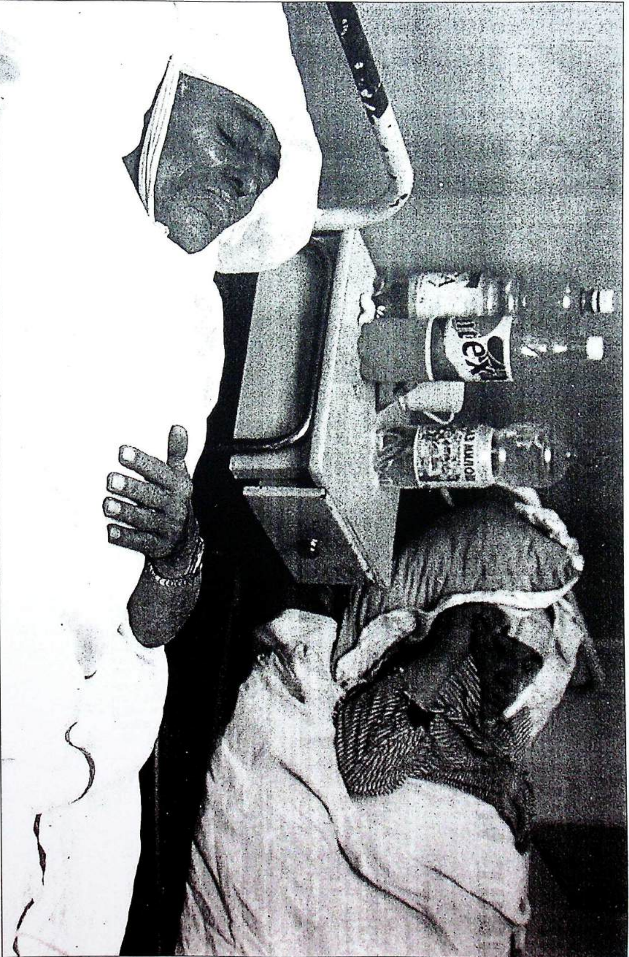
Gewonde burgers in het ziekenhuis in Surduilica.